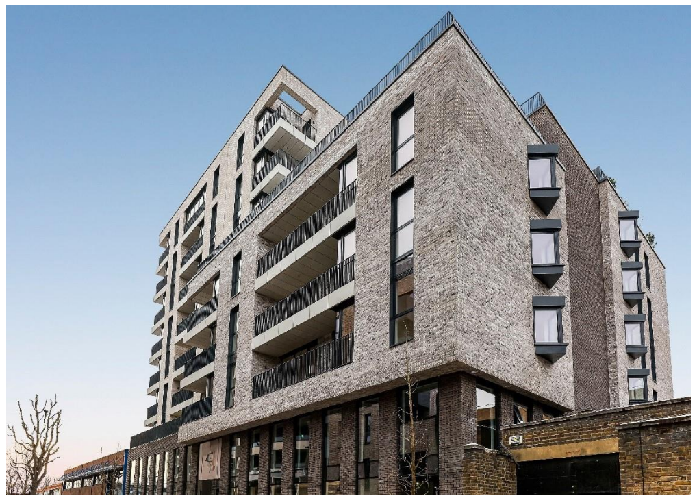
18-19 Crimscott Street SE1