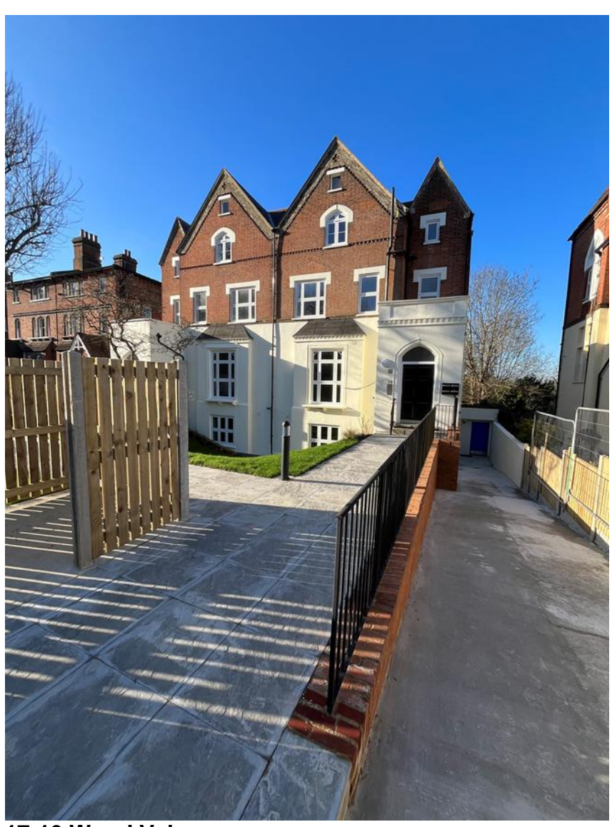
17-19 Wood Vale