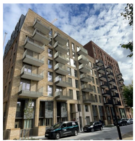
Aylesbury FDS A