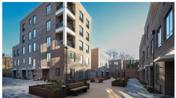
Workshops, 42 Braganza Street SE17